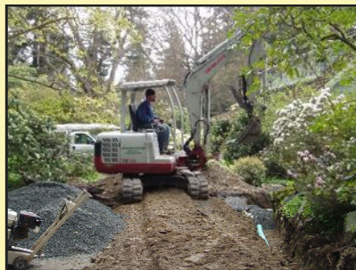
Connected to the sewer system after septic system failure