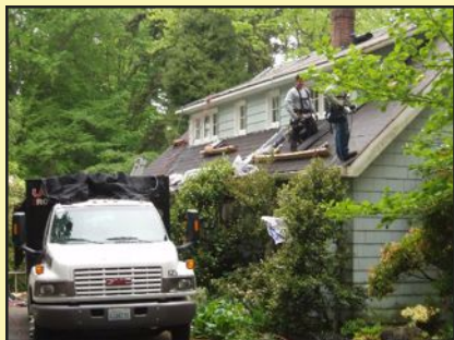
New Roof Installed on Curators' Cottage/Office

Multiple beds are scheduled for renovation this late fall, winter, as the garden requires constant editing and grooming. It is a pleasure to be able to live here, and to enjoy the garden. Do plan to attend our upcoming Fall Festival, in October. Your support is needed and welcomed. The garden now has less than ten years before it's 100 th anniversary, and there is plenty to keep us busy between now and then. With your support we look forward to the next one hundred years!