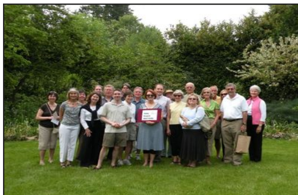
Dunn Gardens Supporters say “This Place Matters”

The E.B. Dunn Historic Garden Trust is dedicated to conserving historically significant gardens in the Northwest. Specific purposes of the Garden Trust include: conservation of the Dunn Gardens for use and enjoyment of the public; conservation of other historically or horticulturally significant gardens in the Northwest; and public education about the history, horticulture, restoration and preservation of gardens in the Northwest.