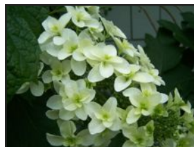
Lily and Hydrangea

Stroll Through the Woodland Glen—Fall Foliage Festival 2007>>>