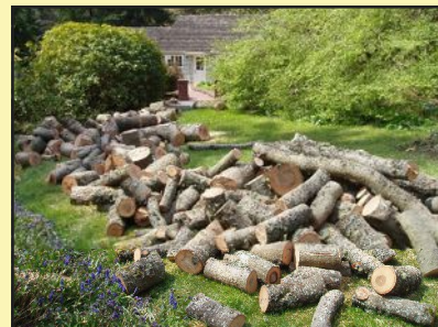
Diseased Quercus coccinea (Scarlet oak) was cut down this spring