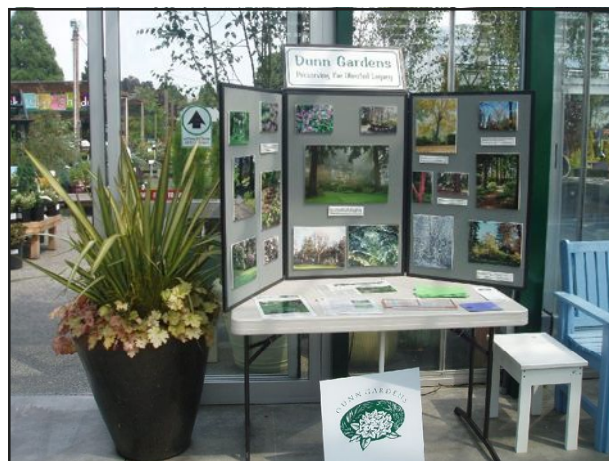
Telling The Dunn Gardens Story at Swanson's Nursery