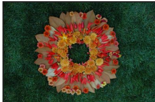
Floral Wreath